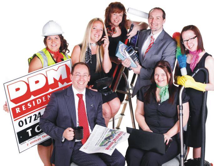
Our Full Service Lettings Team